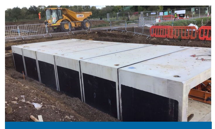
Finished section of flood culvert