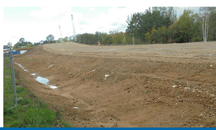
Finished embankment leading to the new railway bridge. The embankment is 8m higher than the original ground. The finished level of the embankment is expected to be at the same level as the M4 as this is the height required to clear the railway