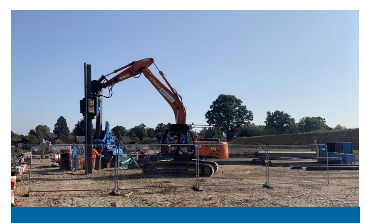
Sheet piling being installed