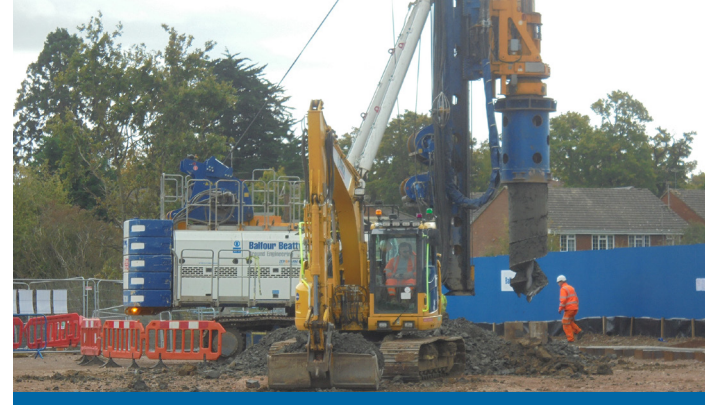
Rotary excavation for the piles is progressing. Piling work is taking place on both sides of the railway simultaneously. The tall blue cranes can be seen from the Reading Road and surrounding area