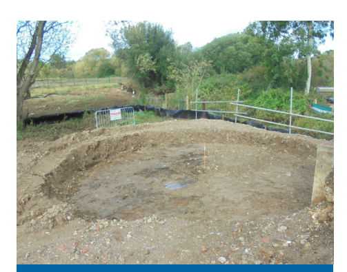
Ground preparaton for caissons which will be used for the foundation of the new footbridges in the Emmbrook watercourse