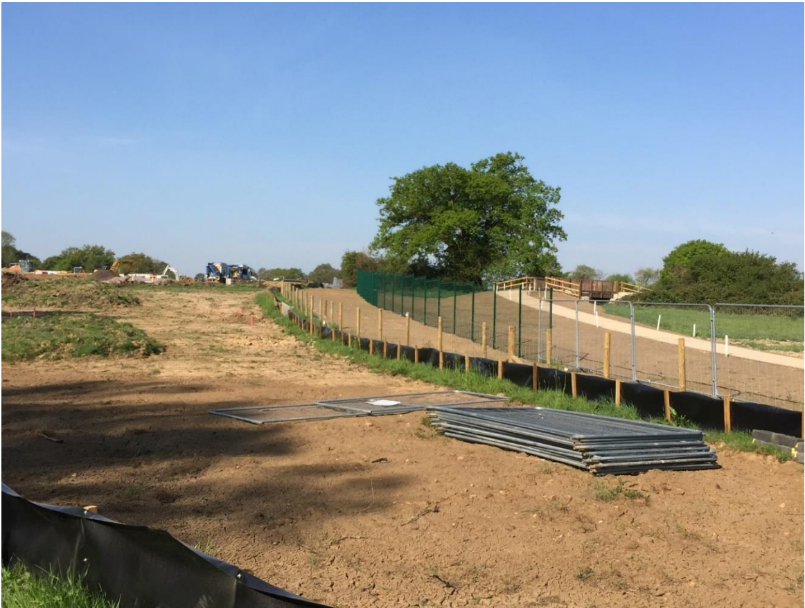
View westward showing relationship of the NDR alignment to tree T77