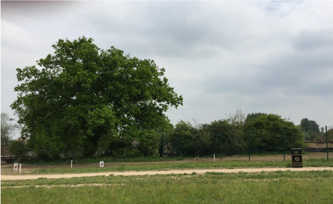
View eastward of Tree T77 and remaining part of south eastern section of Group G134