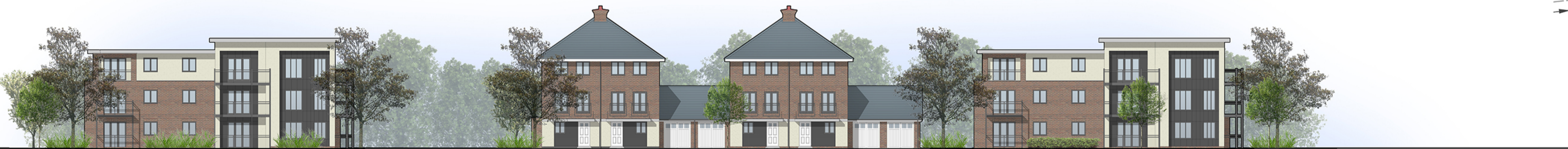
STREET SCENE .F-F.