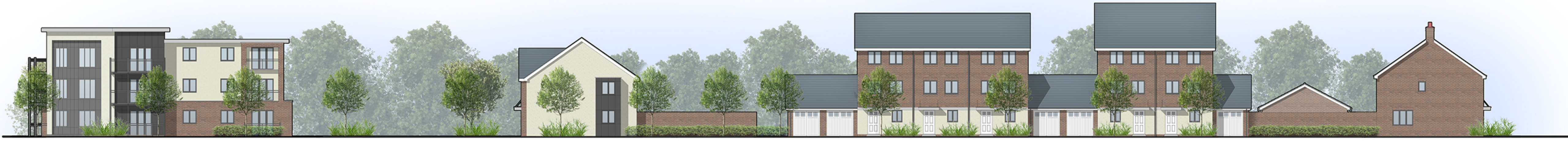
STREET SCENE .A-A.