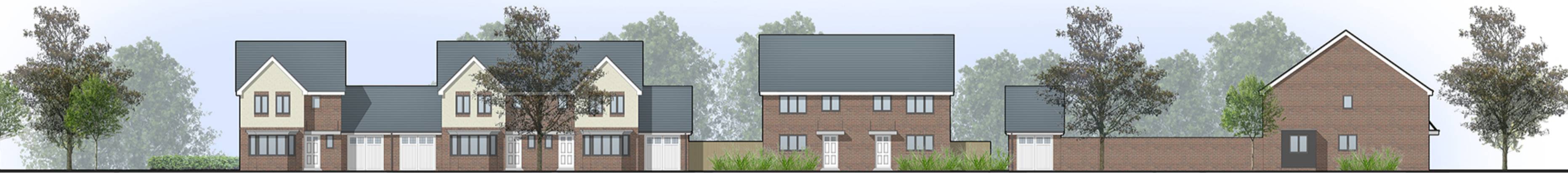
STREET SCENE .E-E.