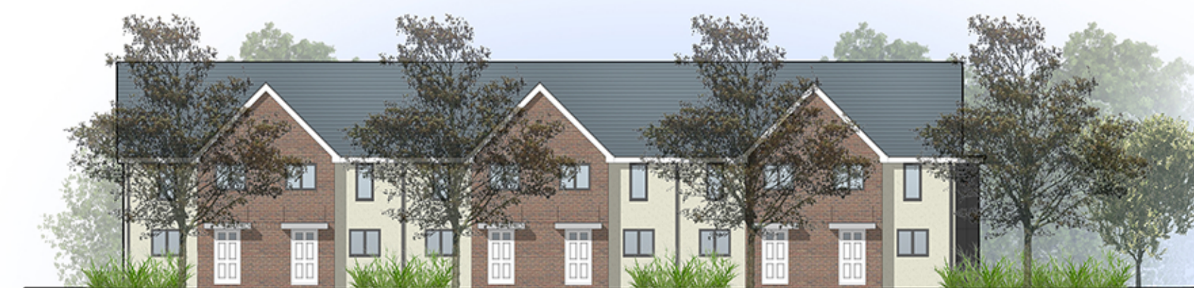
STREET SCENE .G-G.