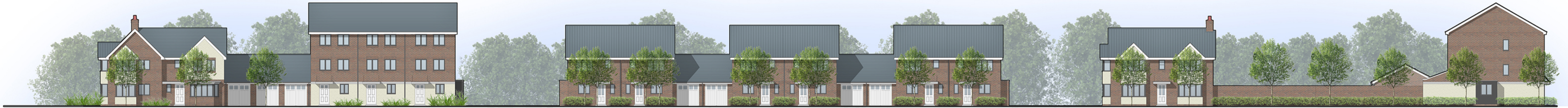
STREET SCENE .B-B.