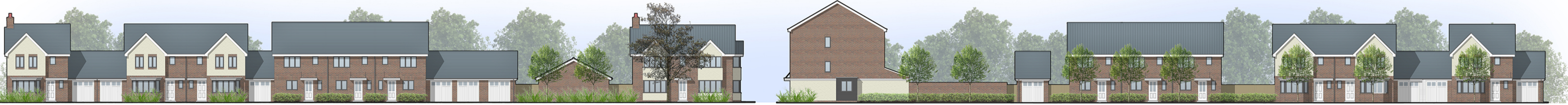
STREET SCENE .C-C.